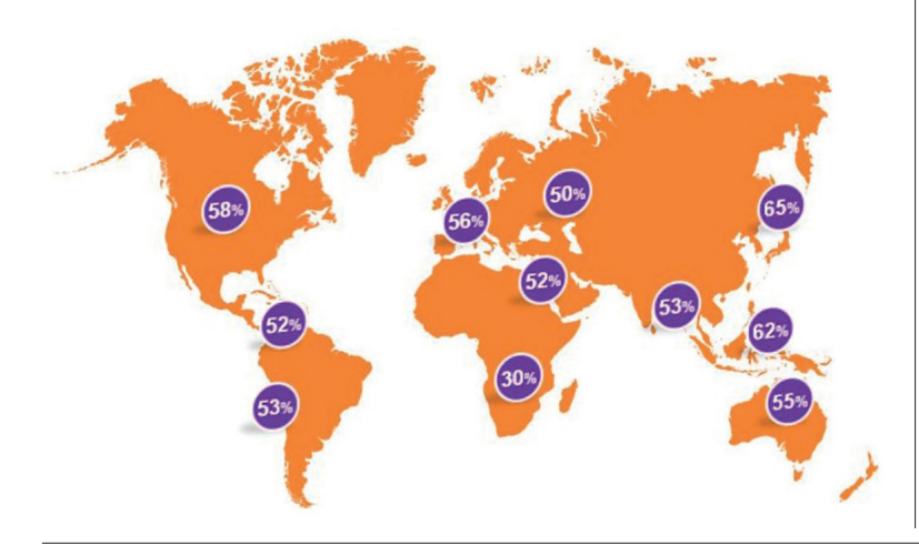
FIGURE 1 Predicted prevalence of myopia by 2050 (adapted from Holden et al)<sup>1</sup>

Myopia has always been considered as a benign condition that can usually be adequately corrected with spectacle or contact lenses and even though the condition might have progressed regardless of the age of the patient, the usual treatment is simply to increase the negative power of the correcting lenses without much thought about attempting to halt or slow the progression of myopia. One traditional method used to slow myopia progression was to under-correct the myopic error which does not appear to have any retarding benefit but on the contrary, increases the progression.<sup>2,3</sup> Bifocal and progressive multifocal spectacle lenses have also been prescribed for years to slow myopia progression and it has been shown in studies that although there is a slowing